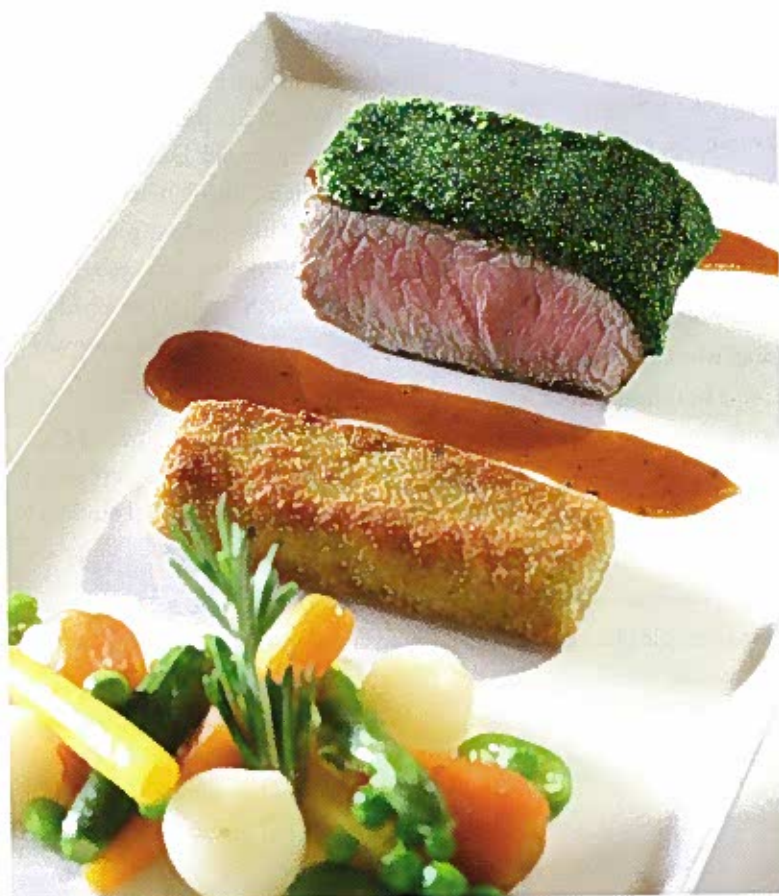
Herb-crusted veal loin, crispy "tête de veau", vegetables and natural jus

"This is a real pleasure. My pleasure is to see that I am astonished at what they can do. And often it's better than I could have done it when I was the chef in the middle of my team."