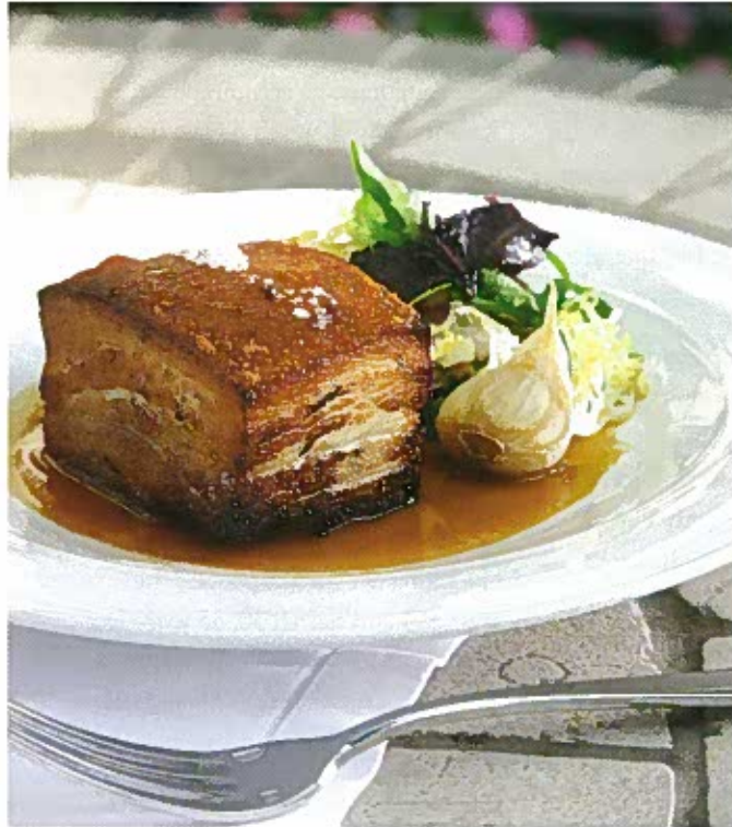
24-hour sous-vide pork belly with natural thyme and garlic jus

They have to love other people and love giving other people pleasure. When you are a cook, you have to think, "What can I do to make something the best?"